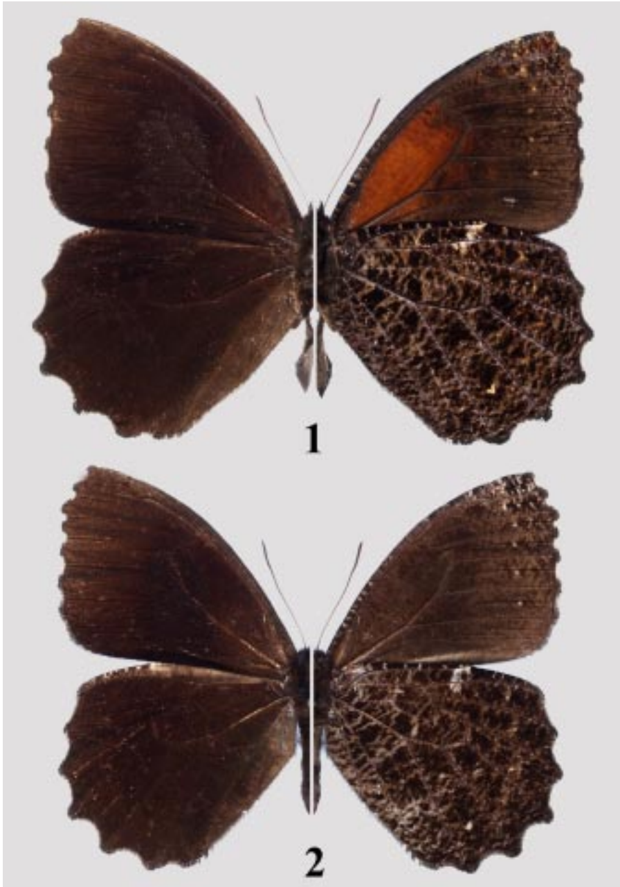
1, 2. Adults (males, dorsum/venter): 1 - Pedaliodes puma puma (Carcel Punco, Puno), 2 - Pedaliodes puma ernsti (paratype)